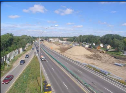
Crosstown reconstruction is midway through a four-year project.