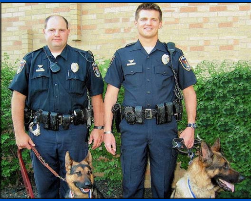
33 department officers assisted St. Paul Police during the Republican National Convention.