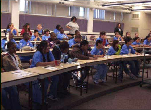
Richfield Police held a Teen Academy funded by the Joint Community Police Partnership.