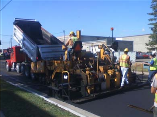
The City resurfaced 3.9 miles of streets in 2008 as part of its street maintenance program.