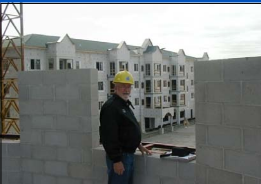
Staff issued more than 4,440 permits and performed over 5,670 inspections in 2008.