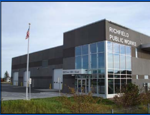
The Maintenance Facility opened in June. One of its many 'green' features are rain gardens which collect water runoff.

Dutch Elm Disease experienced its worst year in 24 years. Forestry staff marked 490 private and public trees. Staff has been unable to keep up with removals and 139 trees still need to be removed which will carry into next year's budget.