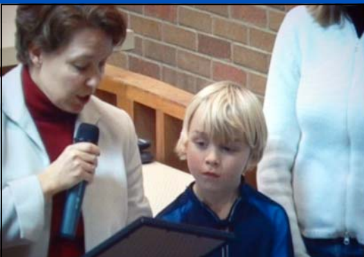
An eight-year-old Richfield resident was recognized with a 911 Hero Award for his actions securing emergency medical help saving his mother's life.