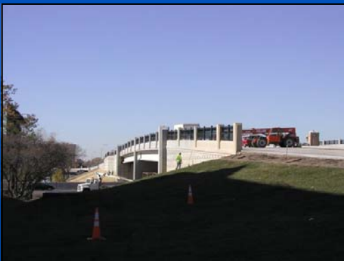
The 76th Street bridge over I-35W re-opened in November after it was rebuilt. The new bridge deck is higher and more biker and pedestrian friendly.